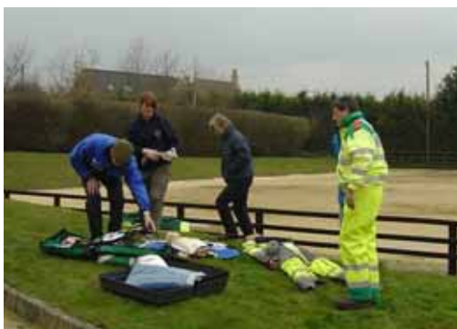
Checking over the equipment

This was all supported with all the equipment we may have to use and the skills stations instructed us on how to use it.