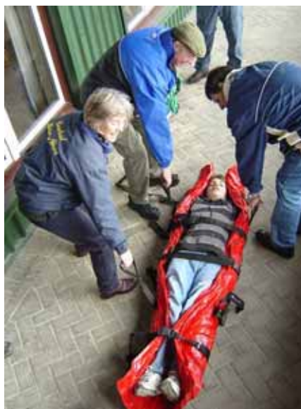
Stabilisation and Dispatch

techniques, e.g. chest drains unless absolutely necessary.