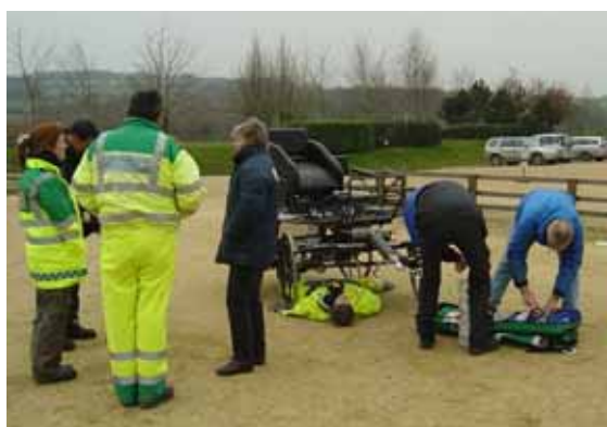
Stabilising and extricating a patient from beneath a carriage

There were about 20 delegates. For the moulages and skills stations we divided into teams of 4 or 5 taking it in turns to lead. The majority of the moulages were riding related but not all. How do you get an injured person out of a drainage pipe for instance?